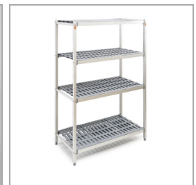
Shelf as accessory